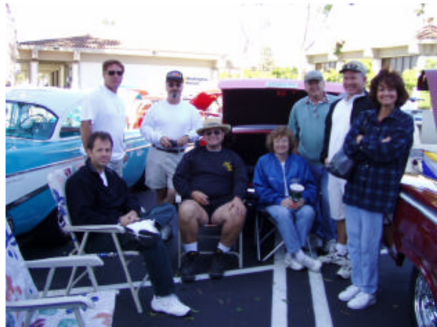
Having Fun at The Ventura Chevy Club Car Show in Oxnard