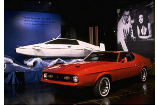
From The Movies, The James Bond Cars