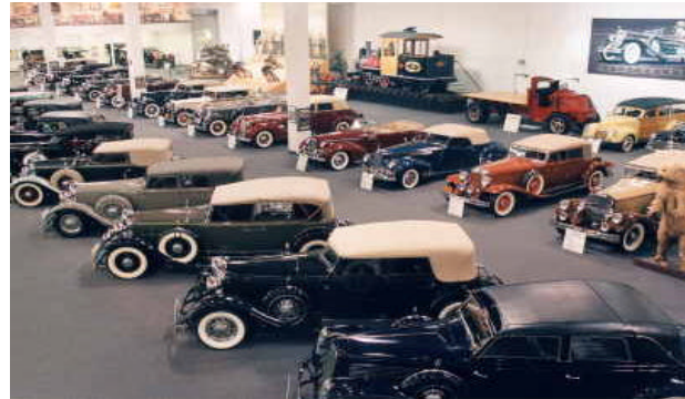
The Otis Chandler Collection

Among the many automobiles, we were treated to other great collectibles, including vintage and classic motorcycles, bronze statues, tapestries, wildlife dioramas (yes that is spelled correctly), a full size 1800s